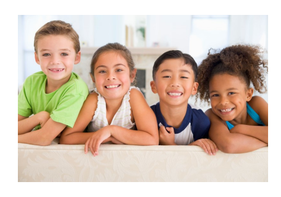
Where abuse ends and healing begins